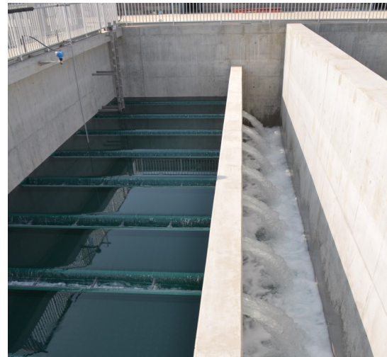
Poseidon Filtration System®

Orthos' Centurion™ structurally-superior filter underdrains feature nozzles with solid-expelling slots, specifically-sized to retain the DDBF™ media and prevent biological fouling. No gravel layer is necessary, which reduces hydraulic profile and eliminates related horizontal short-circuiting.