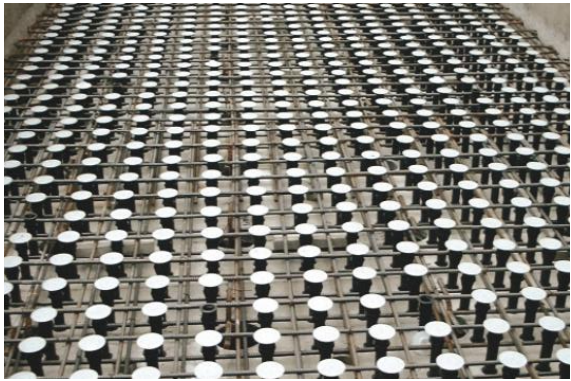
Installed threaded sleeves and protection caps