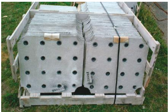
Flat GRC Panels delivered in crates