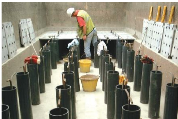
Column forms, cut to size and leveled