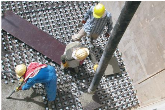
Pouring and vibration of concrete Trowel level to caps