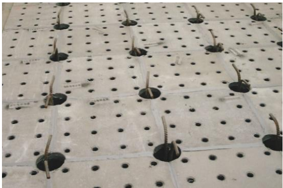
Panels sealed to column forms and abutting panel